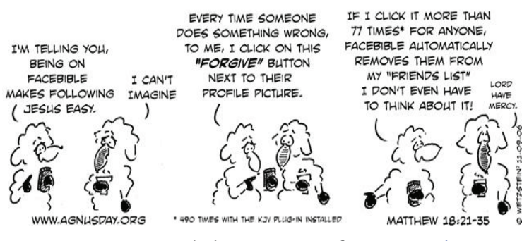
Agnus Day

The cross is today the universal image of Christian belief. Countless generations of artists have turned it into a thing of beauty to be carried in procession or worn as jewelry. To the eyes of the first Christians, it had no beauty. It stood outside too many city walls, decorated only with decaying corpses, as a threat to anyone who defied Rome's authority—including Christians who refused sacrifice to Roman gods. Although believers spoke of the cross as the instrument of salvation, it seldom appeared in Christian art unless disguised as an anchor or the Chi-Rho until after Constantine's edict of toleration. (From franciscanmedia.org)